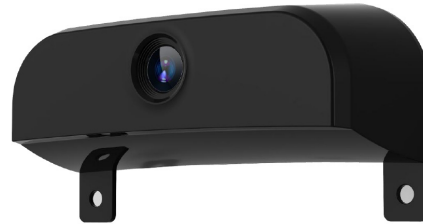
Thermal Sensor Module