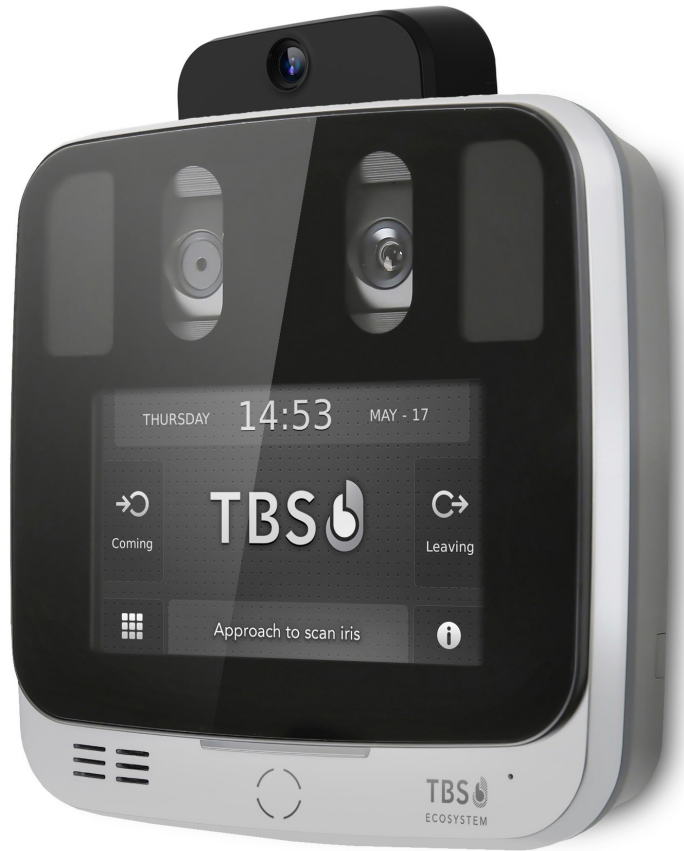
2D EYE THERMAL